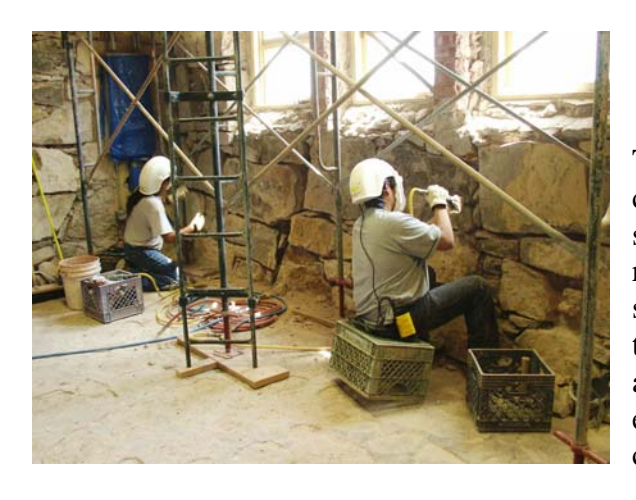
The crew is currently stabilizing and repointing the stonework in these storage areas at the east end of the church.