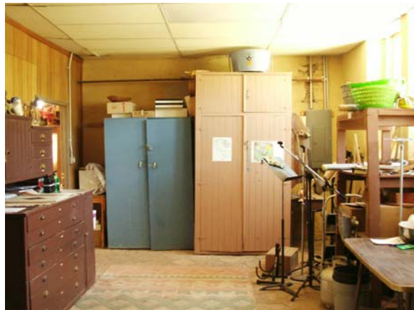
west side east side

Here we see the sacristy with the drop ceiling removed, heater and furniture taken out, and the plaster removed: