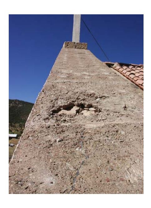
West Cornice before & after