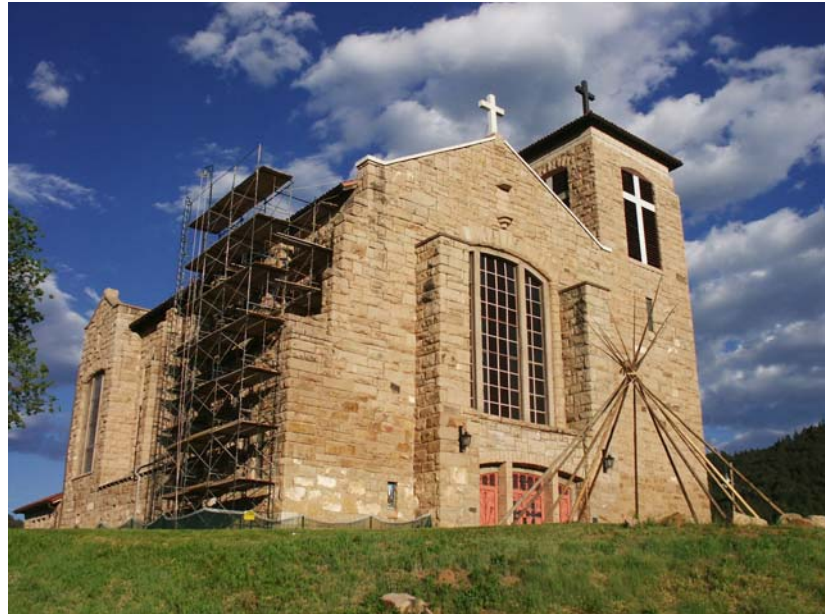
Scaffold on the north wall

This summer the restoration crew completed the restoration of the north wall exterior. Another milestone!