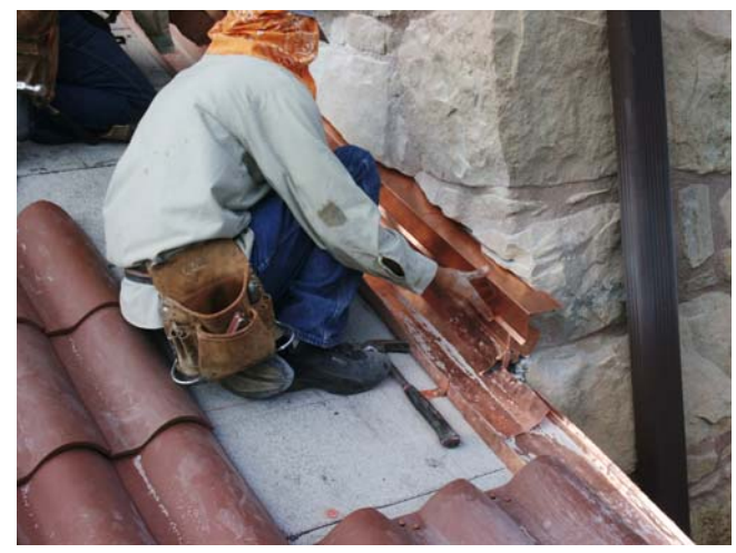
The crew from Smith Roofing, Inc . re-roofs the two sections of roof on the east end of the church, using Ludowici clay roof tiles and heavy duty copper flashing. KD Enterprises installed the new copper gutters and downspouts on the lower roof of the east end.