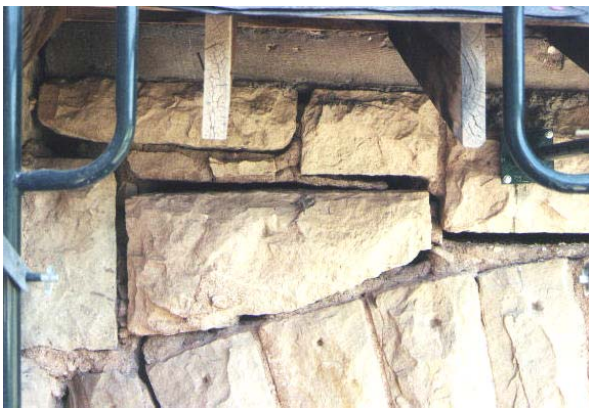
Examples of the stonework before any work is done.