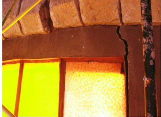
Along with the discovery of many holes (and bat caves) in the west wall we found that the window frame is actually supporting part of the stone arch above.

This winter season we have restored and strengthened approximately half of the west wall, starting from the top and working down.