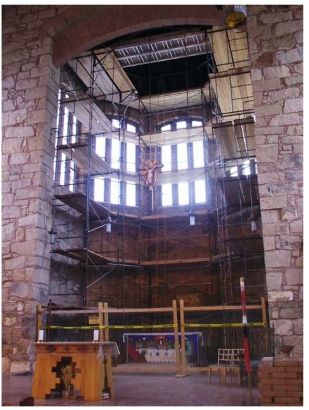
Scaffolding in the apse of the church