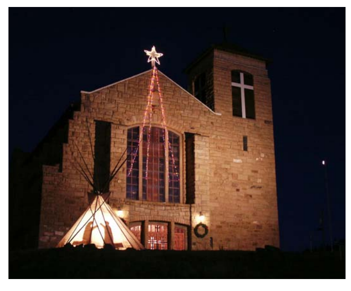
Nighttime view seen from Highway 70