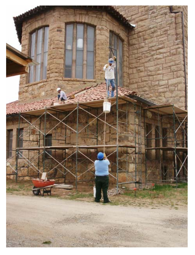
The crew removing roof tile in preparation for summer work on the apse exterior.