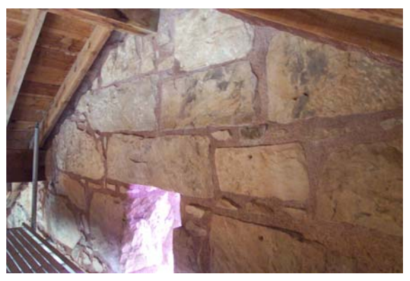
After: Repointing complete.