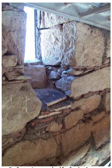
Before: Lower half of window area in bad need of repair.