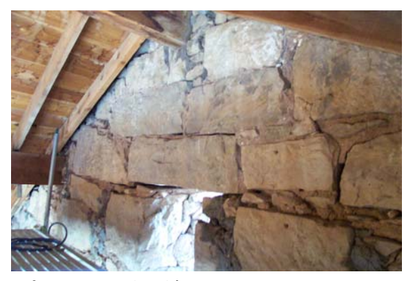
Before: Damage is evident.