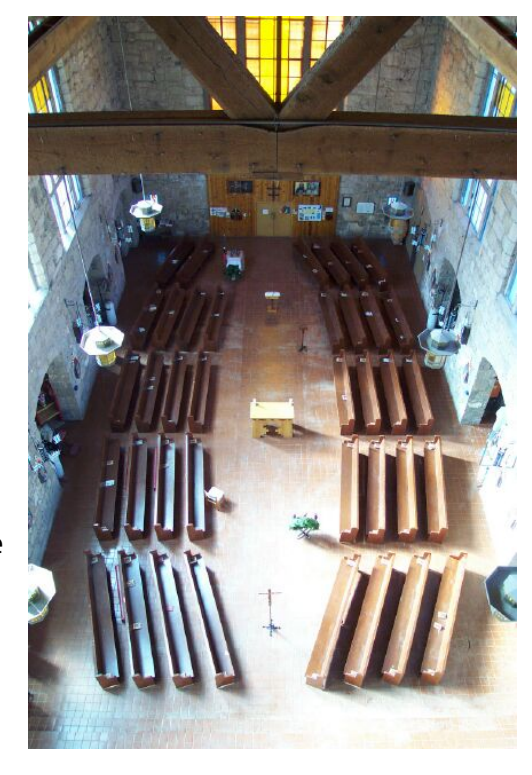
View from the Bridge