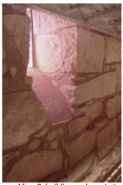
After: Rebuilding and repointing Completed.