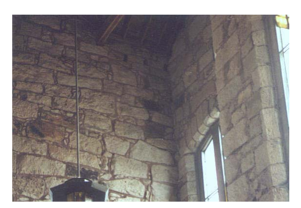
South transept before and after.