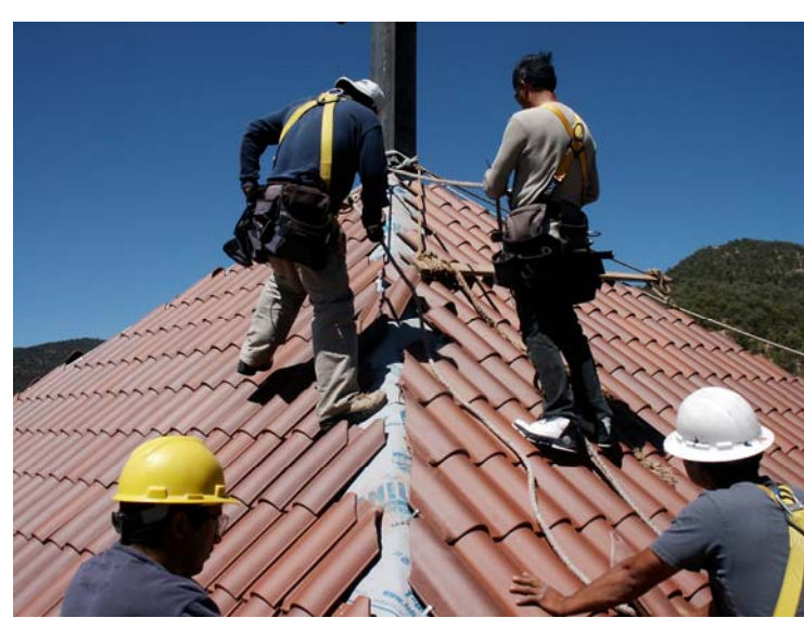
Roof Crew getting ready to do the tile hips.