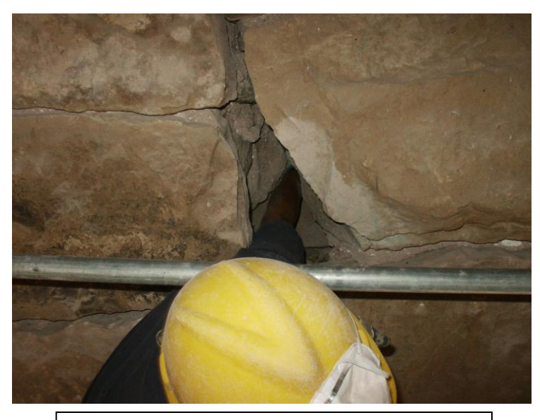
Sam preparing a deep void for repointing.

Illustrated Progress Report for November 2010 through April 2011