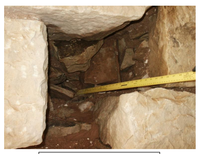
One of the several deep voids.