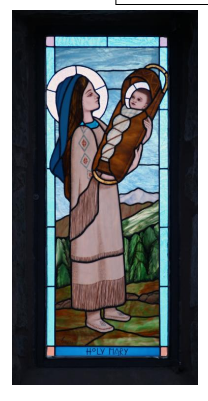
Our Lady window installed.