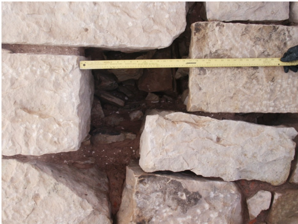
Example of before

The winter brought many different challenges for us. The repointing work went slower than we had anticipated due to the extensive deterioration and missing stones on the top rows on the section of the southeast interior wall. The crew found themselves constantly stopping to cut a stone to the right dimensions in order to replace the missing ones. By the end of March they finished the area and removed the scaffolding. The finished section of the