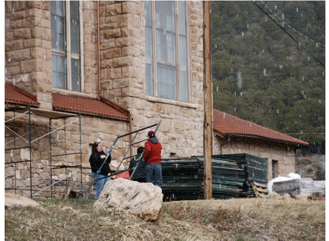
Texas Tech volunteers working in the snow.

They also spent a day working with our crew moving scaffolding and did not stop until the job was complete even though it snowed most of the day and was extremely cold.