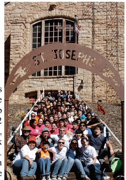
The High School Group