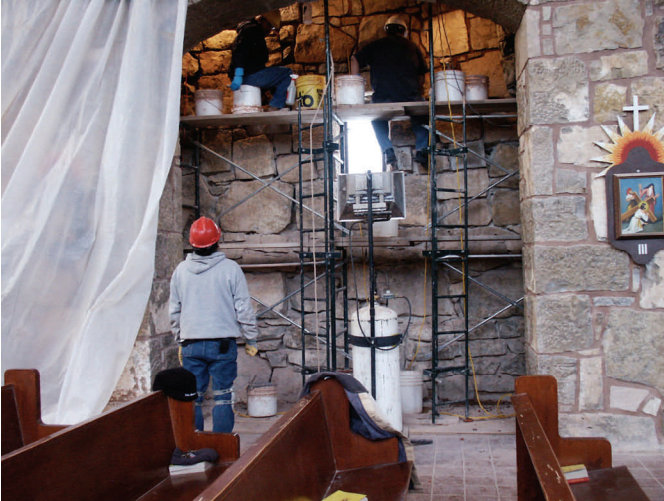
Tommy inspecting alcove work

completed by the time you read this. This will leave 1 alcove roof and the choir loft staircase room roof to complete the roof project. We will be excited to see the last tile installed!