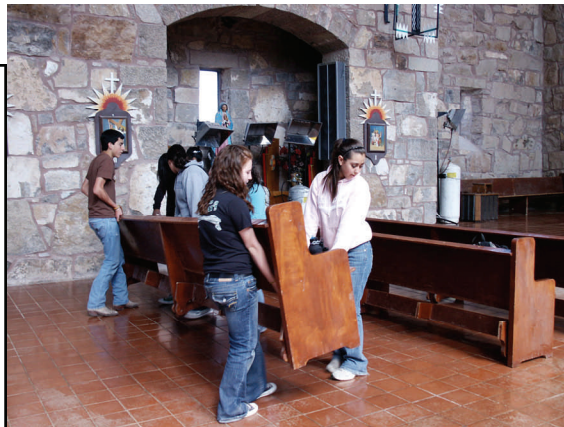
Incarnate Word Academy students moving pews.

There were 72 high school students plus their chaperones in the second group from Incarnate Word Academy in Corpus Christi, TX. The group was broken down into groups of 9 and we had 2 groups for three days. These students dusted, mopped and waxed the church floors, moved back the pews and all of the items back into the alcoves. Some of the volunteers also cleaned up the church grounds and planted flower boxes to decorate the interior of the Mission. This was a tremendous help, and the Mission looks so refreshed.