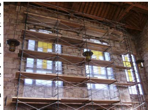
North wall interior